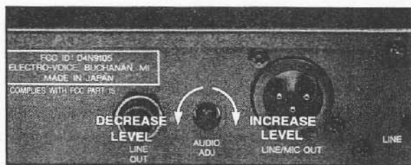
Figure 3 - Adjust Audio Output Level, Rear Panel